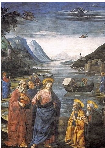
Calling of the Apostles by Domenico Ghirlandaio, c. 1481. Sistine Chapel

7.00am Mass 8.30am Mass 10.00am Mass 6.00pm Mass (Youth) - Live Streamed