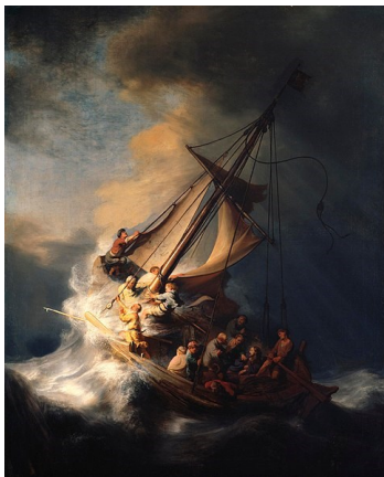
The Storm on the Sea of Galilee by Rembrandt, c. 1633. Location unknown since 1990.

6.30am Mass 8.00am Mass 9.15am Mass 10.30am Mass 6.00pm Mass (Youth)