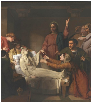
The Raising of Jairus' Daughter by Henry Thomson, c. 1820. Tate Britain, London

7.00am Mass 8.30am Mass 10.00am Mass 6.00pm Mass (Youth)