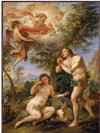
The Rebuke of Adam and Eve by Charles-Joseph Natoire, c. 1740. Metropolitan Museum of Art

6.30am Mass 8.00am Mass 9.15am Mass 10.30am Mass 6.00pm Mass (Youth)