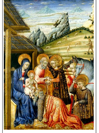
The Adoration of the Magi by Giovanni di Paolo, c. 1460. Metropolitan Museum of Art