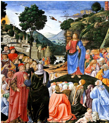
Sermon della Montagna (Sermon on the Mount) by Cosimo Rosselli, c. 1481 - 1482. Sistine Chapel

6.30am Mass 8.00am Mass 9.15am Mass 10.30am Mass 6.00pm Mass (Youth)