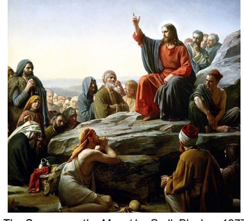
The Sermon on the Mount by Carlk Bloch, c.1877. The Museum of National History, Denmark