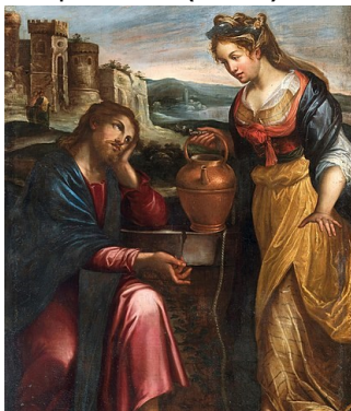
Christ and the Woman of Samaria by Lavinia Fontana c. 1607. National Museum of Capodimonte (Naples)

6.30am Mass 8.00am Mass 9.15am Mass 10.30am Mass 6.00pm Mass (Youth)