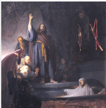
The Raising of Lazarus by Rembrandt, c. 1630-32 Los Angeles County Museum of Art.

6.30am Mass 8.00am Mass 9.15am Mass 10.30am Mass 6.00pm Mass (Youth)