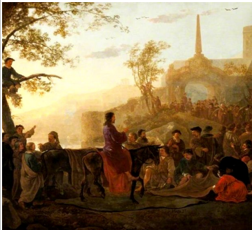
Christ Riding Into Jerusalem by Aelbert Cuyoo, c. 1650 Kelvingrove Art Gallery & Museum

6.30am Mass 8.00am Mass 9.15am Mass 10.30am Mass NO 6.00pm/Youth Mass