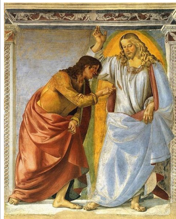
Christ and the Doubting Thomas by Luca Signorelli c. 1477-1482 (Fresco), Pontifical Basilica of the Holy House of Loreto

6.30am Mass 8.00am Mass 9.15am Mass 10.30am Mass 6.00pm Mass (Youth)