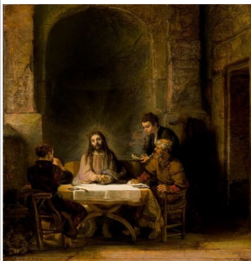
Supper at Emmaus by Rembrandt c. 1648. Louvre Museum

6.30am Mass 8.00am Mass 9.15am Mass 10.30am Mass 6.00pm Mass (Youth)