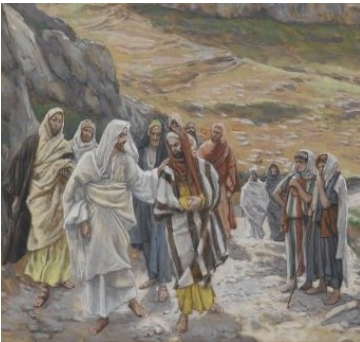
Jésus s'entretient avec ses disciples (Jesus Discourses with His Disciples) by James Tissot, c. 1886-96. Brooklyn Museum

6.30am Mass 8.00am Mass 9.15am Mass 10.30am Mass 12.00pm Baptisms 6.00pm Mass (Youth)