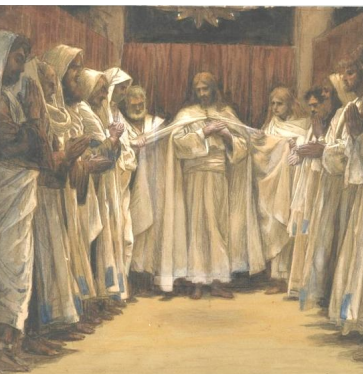
Dernier Sermon de Notre-Seigneur (The Last Sermon of Our Lord) by James Tissot, c. 1886-96. Brooklyn Museum

6.30am Mass 8.00am Mass 9.15am Mass 10.30am Mass 6.00pm Mass (Youth)