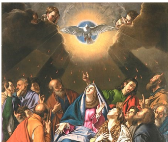
Pentecostés by Juan Bautista Maino c. 1615-20. Museo del Prado, Spain

6.30am Mass 8.00am Mass 9.15am Mass 10.30am Mass 6.00pm Mass (Youth)