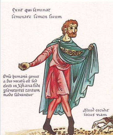
Das Gleichnis vom Sämner (The Parable of the Sower) by Herrad of Landsberg, c.1167-85. Hortus deliciarum (a medieval manuscript)

6.30am Mass 8.00am Mass 9.15am Mass 10.30am Mass 6.00pm Mass (Youth)