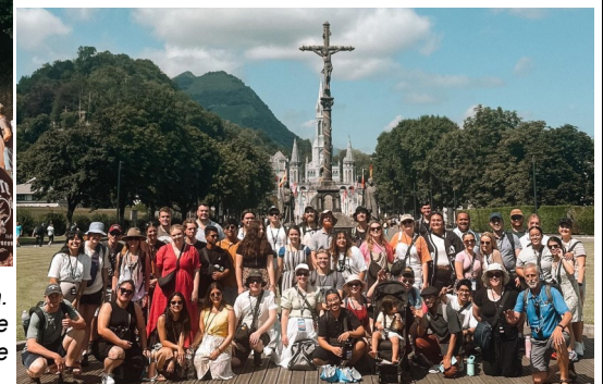
Brisbane Pilgrims at Lourdes & Fatima. Photographs from the Archdiocese of Brisbane Facebook Page