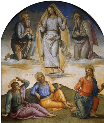
Transfiguration of Jesus by Pietro Perugino c. 1496-1500. Collegio del Cambio, Pérouse

6.30am Mass 8.00am Mass 9.15am Mass 10.30am Mass 6.00pm Mass (Youth)