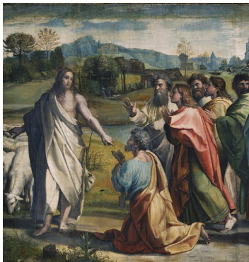
Christ's Charge to Peter by Raphael, c 1515. Victoria & Albert Museum, London.

6.30am Mass 8.00am Mass 9.15am Mass 10.30am Mass 6.00pm Mass (Youth)