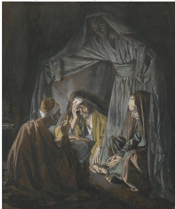
Two or Three Gathered in My Name by James Tissot, c. 1886-94. Brooklyn Museum

6.30am Mass 8.00am Mass 9.15am Mass 10.30am Mass 6.00pm Mass (Youth)