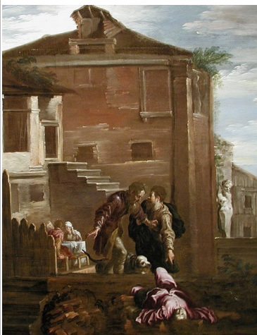
Parabola dei vignaioli omicidi by Domenico Fetti, c. 1620. Currier Museum of Art, Manchester

6.30am Mass 8.00am Mass 9.15am Mass 10.30am Mass 6.00pm Mass (Youth)