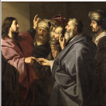
The Tribute Money by Jacob Adriaensz Backer, c. 1630s. Nationalmuseum, Sweden

6.30am Mass 8.00am Mass 9.15am Mass 10.30am Mass 6.00pm Mass (Youth)