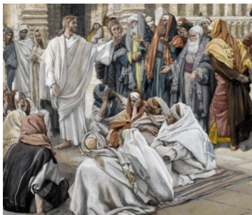
The Pharisees Question Jesus by James Tissot, c. 1886-94. Brooklyn Museum

6.30am Mass 8.00am Mass 9.15am Mass 10.30am Mass 6.00pm Mass (Youth)