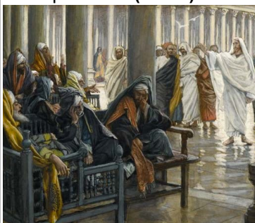
Malheur à vous, scribes et pharisiens by James Tissot, c. 1886-94. Brooklyn Museum

6.30am Mass 8.00am Mass 9.15am Mass 10.30am Mass 12.00pm Baptisms 6.00pm Mass (Youth)