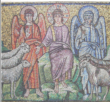
Separation of Sheep and Goats . Reproduction of a 6th Century Byzantine Mosaic. Metropolitan Museum of Art.

6:30am Mass 8:00am Mass 9:15am Mass 10:30am Mass 6:00pm Mass (Youth)