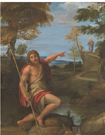
Saint John the Baptist Bearing Witness by Annibale Carracci, c. 1600. Metropolitan Museum of Art.

6.30am Mass 8.00am Mass 9.15am Mass 10.30am Mass 6.00pm Mass (Youth)