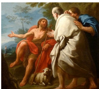
Saint John the Baptist Designating the Messiah by Étienne Parrocel c. 1730. Calvet Museum

8.00am Christmas Mass 9.30am Christmas Mass