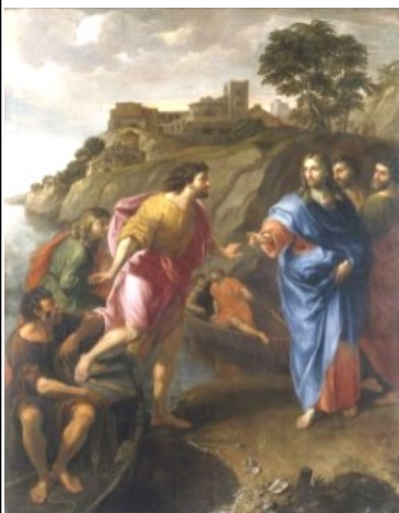
The Calling of the Sons of Zebedee by Arnould de Vuez, c. 1680s.

6.30am Mass 8.00am Mass 9.15am Mass 10.30am Mass 6.00pm Mass (Youth)