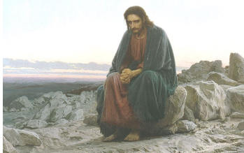
Christ in the Wilderness by Ivan Kramskoi, c. 1872. Tretyakov Gallery

6.30am Mass 8.00am Mass 9.15am Mass 10.30am Mass 6.00pm Mass (Youth)