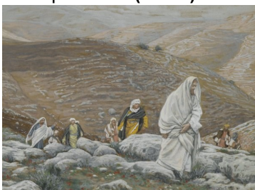
With Passover Approaching, Jesus Goes Up to Jerusalem by James Tissot c. 1886-94. Brooklyn Museum.

6.30am Mass 8.00am Mass 9.15am Mass 10.30am Mass 6.00pm Mass (Youth)