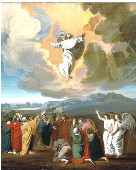
"The Ascension" by John Singleton Copley c. 1775 Museum of Fine Arts, Boston

6.30am Mass 8.00am Mass 9.15am Mass 10.30am Mass 12.00pm Baptisms 6.00pm Mass (Youth)