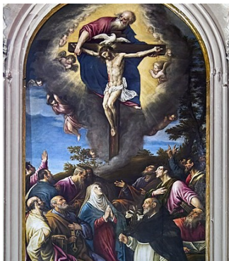
The Trinity by Leandro da Bassano c. 1593-95. Santi Giovanni e Paolo, Venice

6.30am Mass 8.00am Mass 9.15am Mass 10.30am Mass 6.00pm Mass (Youth)